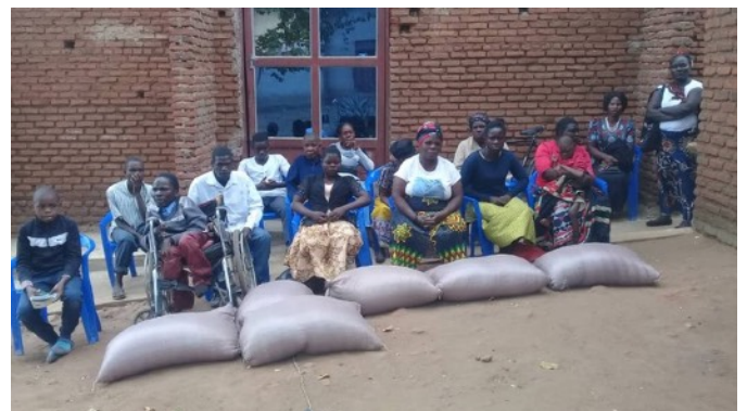
Inflation and bad weather conditions increase the need for food, especially to the disabled and needy.