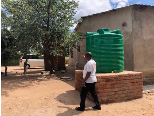
Two desperately needed water collection tanks were installed at Bimbi and Mvera schools.