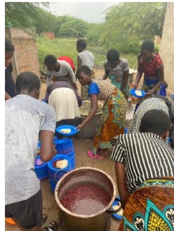
Kid's clubs leaders show up faithfully every week to help cook or lead a group