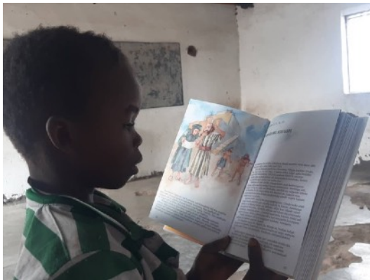
(Left) Thanks to our donor church in Afton, MN for providing Chichewa Children's Bibles. Pray the Word of God will not return void.