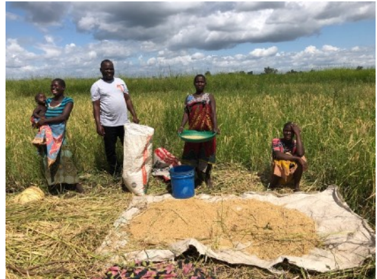
We thank God for the rice harvest at the Bimbi garden site. Pray with us for the vegetable harvest and for the completion of this project which will eventually bless 7 communities.