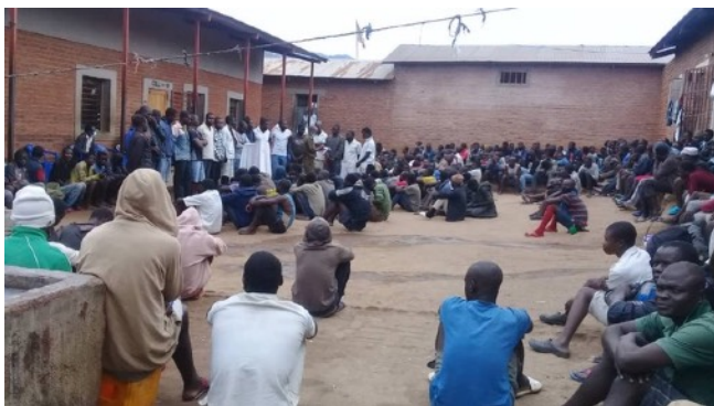
Alpha Bible class in a local prison