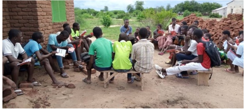
(above) Local Alpha Group