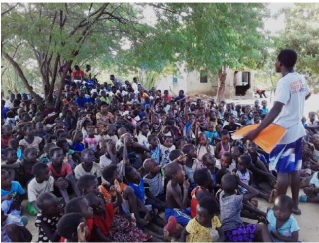
Pray for the hundreds of children who attend this club